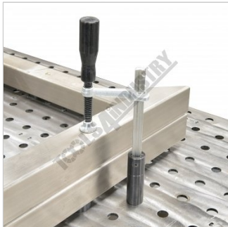
Shown Screwed into Optional Threaded Riser