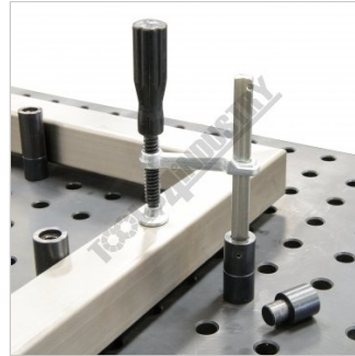
Shown Screwed into Optional Adaptor View2