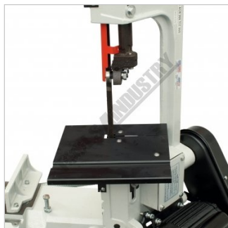
Includes Vertical Table