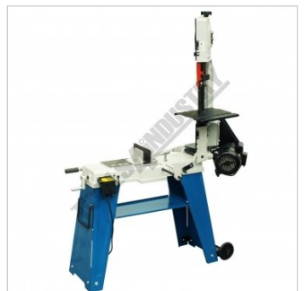
Shown With Vertical Table