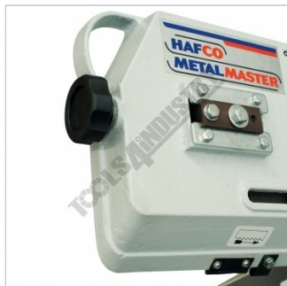
Blade Tension Dial