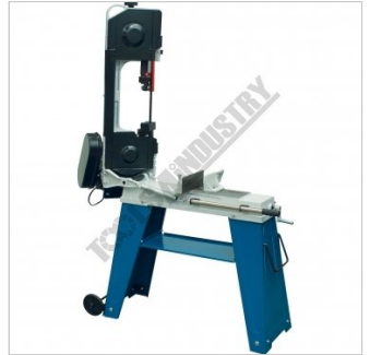
Rear View Head Up