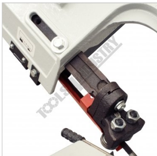
Blade Guide Adjustment