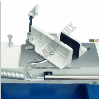
Vice Shown At 45 Degrees