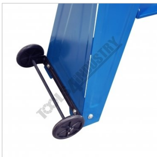
Portable On Wheels