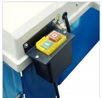
Main Power Switch