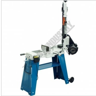
Left View Head Up