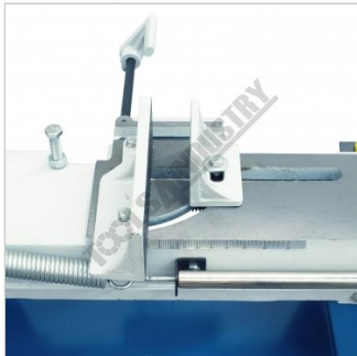
Vice Shown At 90 Degrees