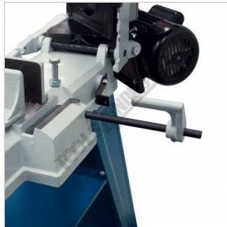
Material Length Stop