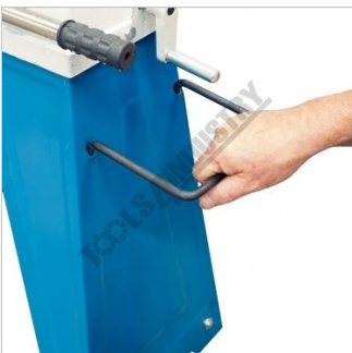
Lifting Handle For Machine Positioning