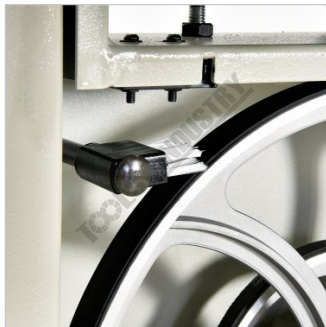
Wheel Cleaning Brush