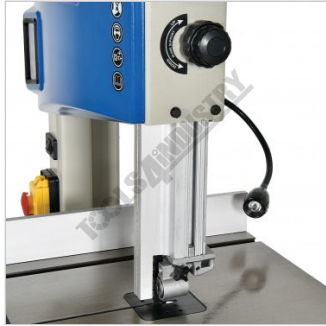
Blade Support Adjustment