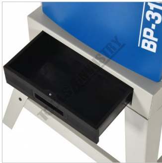
Dust collection Tray