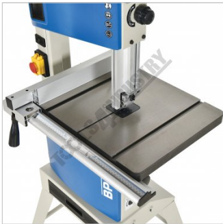
Cast Iron Table with T Slot