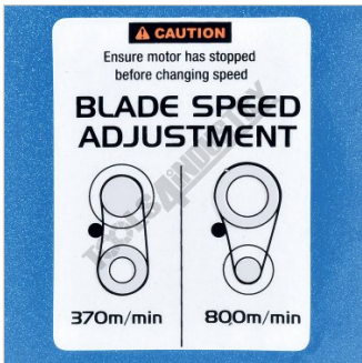
Blade Speed Adjustment