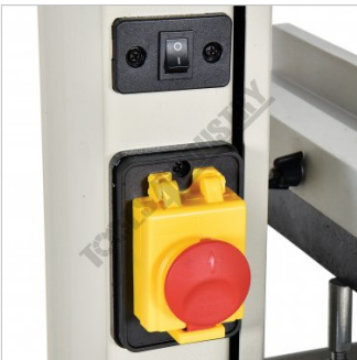
Safety Magnetic Switch and Light Switch