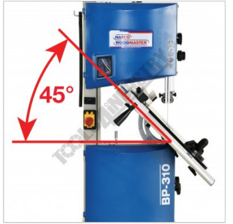
Cast Iron Tilt Table to 45 Degrees