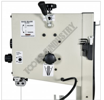
Blade Tension and Tracking Adjustments