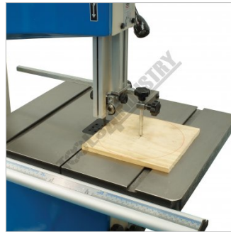
Shown with Optional Circle Cutting Attachment