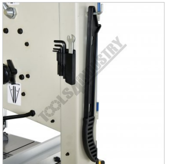
Push Stick and Tools