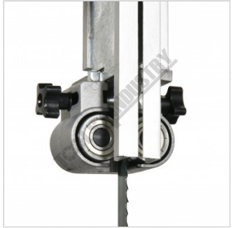
Ball Bearing Blade Guides