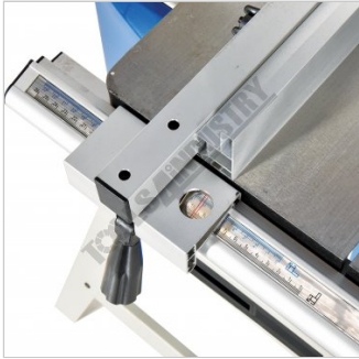
Sliding Rip Fence with High and Low Height Extrusion