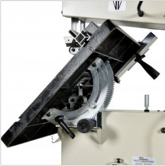
Tilt Table Adjustment