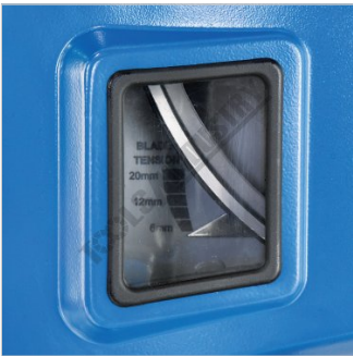
Blade Tension Scale