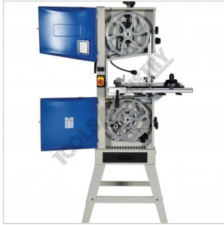
Easy Access for Blade Change