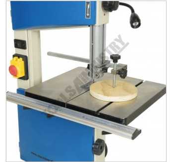
Close Up Shown On BP 255 Wood Bandsaw W950