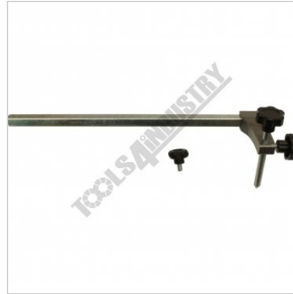
Circle Cutting Attachment