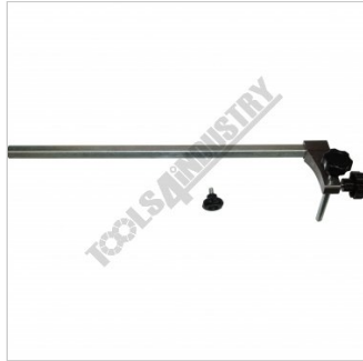
Circle Cutting Attachment