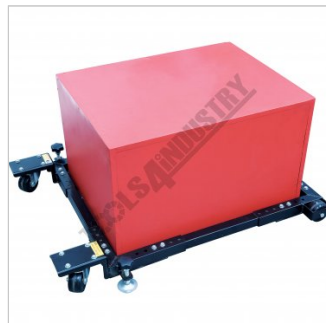
Shown with Box