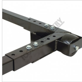
2 x Fixed Wheels