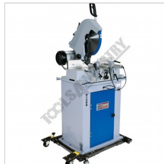
Shown With Machine