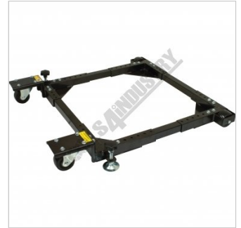
Square Minimum Size 580 x 580mm