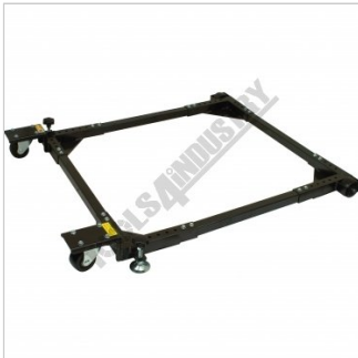
Square Maximum Size 750 x 750mm