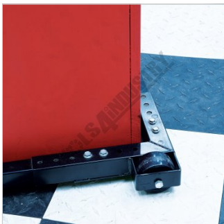
Stable Wheel Design