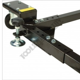
Adjustable Length Frame