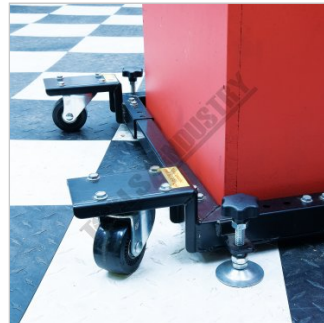
Swivel Castor 360 Degrees