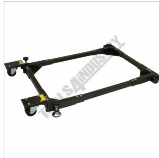
Rectangle 580 x 850mm Shown