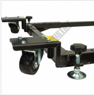
2 x Swivel Wheels with Adjustable Stops