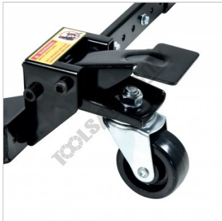
Castors That Swivel 360 Degrees