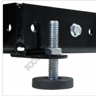
Adjustable Rubber Foot