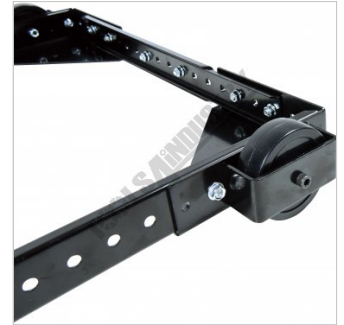
Stable Wheel Design