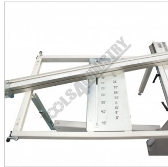
Table Mitre Guide