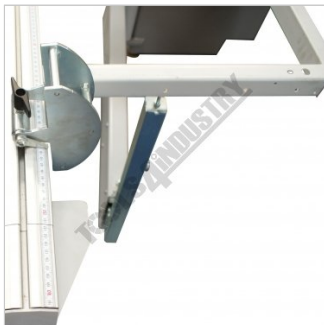
Flip Over Stop