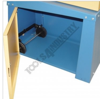
Cabinet Base with Internal Wheels with a External Quick Action Foot Lever