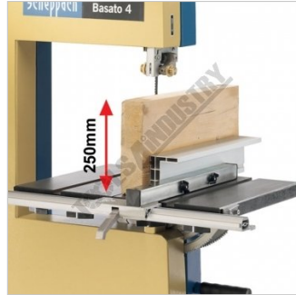
250mm Depth of Cut x 375mm Wide