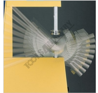
Table Tilt Range from 17° to +45°