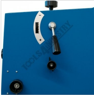
Quick Release System for Changing Band Saw Blade.