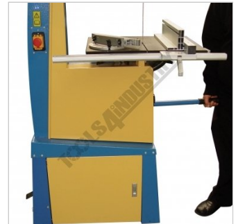
Easy Manoeuvrability with Simple Foot Lever and Lifting Handle