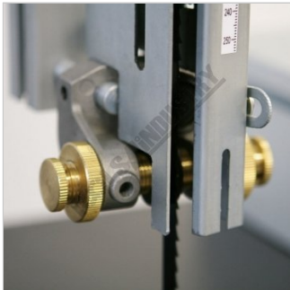
Industrial Triple Top Bearing Guides for Simple and Accurate Setting.