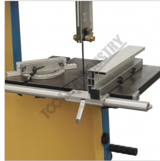
Large Cast Iron Table with Rigid Rip Fence Assembly