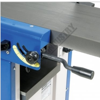
Table Height Adjustment Handle