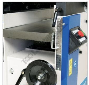
Thicknesser Table Height Adjustment Scale