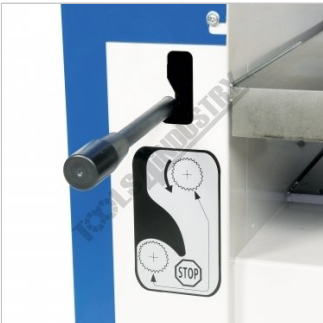
Roller Feed Engagement Lever