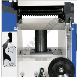
Heavy Duty Central Column Table Support