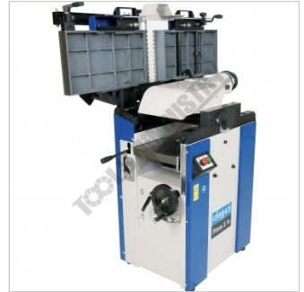
Set-Up For Thicknesser Left View