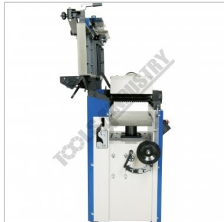
Set-Up For Thicknesser Side View