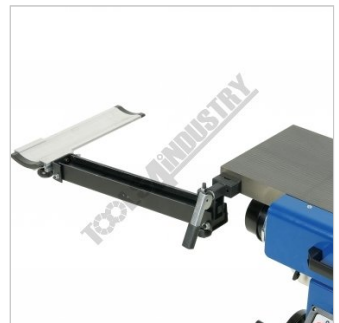
Flip Over Blade Guard