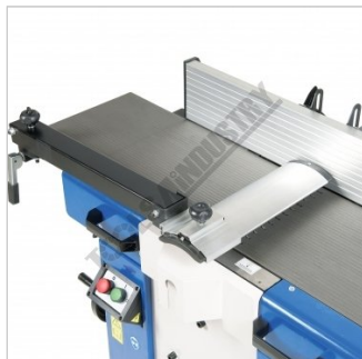
Adjustable Blade Guard