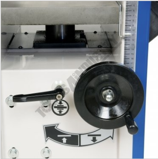
Table Height Adjustment Wheel & Lock Lever