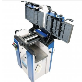
Quick and Easy Table Tilt System