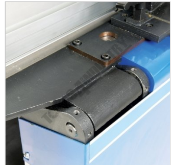
Heavy Duty Planer Table Hinges