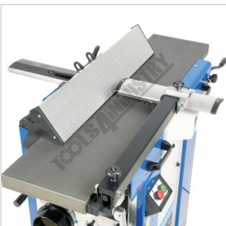
Fence Tilts to 45 Degrees