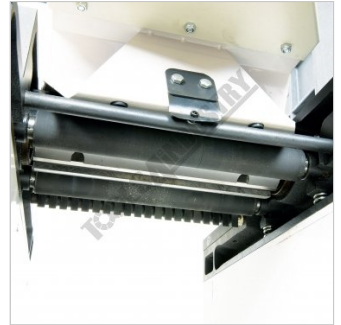
Unique Vulcanised Rubber Feed Rollers