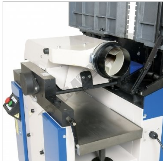
Dust Hood Outlet Shown in Thicknesser Mode