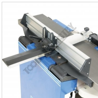
Fence Adjustment Locks