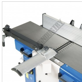
Adjustable Blade Guard Set