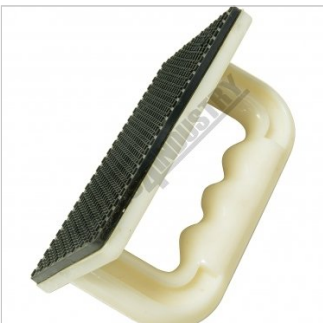
Includes Material Push Paddle