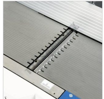
Heavy Duty Cast Iron Tables