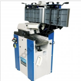
Set-Up For Thicknesser Right View