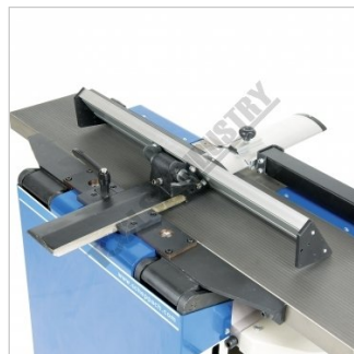
Fence Set-Up at 45 Degrees - Rear View