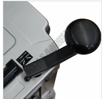
Height Adjustment Handle