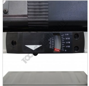
Thickness Depth Cut Indicator