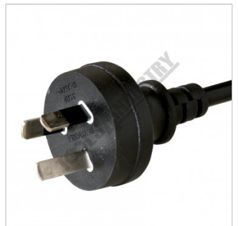
10Amp Power Plug