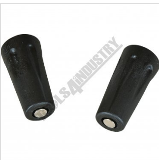
Magnetic Blade Removers