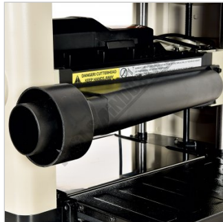
Rear Dust Chute