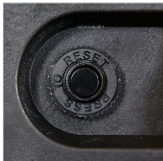
Power Reset Button