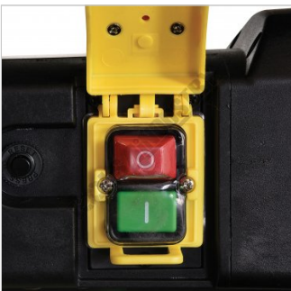
On - Off Safety Switch