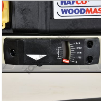
Thickness Depth Cut Indicator