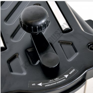
Height Adjustment Handle