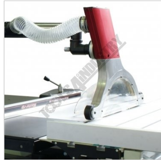
Heavy Duty Overhead Guard