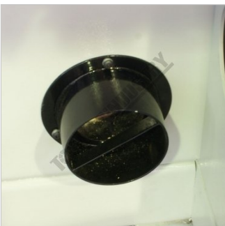
Dust Extraction Outlet