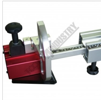
Telescopic Cross Cut Fence 90 2600mm