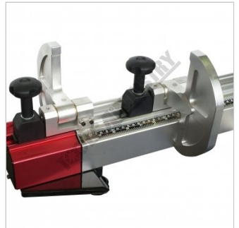
Cross Cut Fence with 2 Flip Over Stops