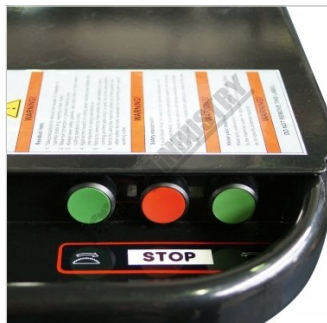
Main and Scribe Blade Start Stop Buttons on Sliding Table