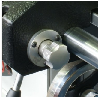
Rip Fence with Fine Adjustment Dial