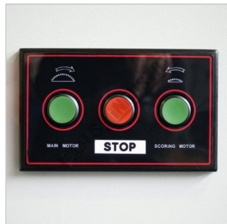
Main and Scribe Blade Start Stop Buttons on Machine