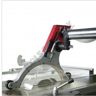
Heavy Duty Overhead Guard with Dust Extraction Outlet