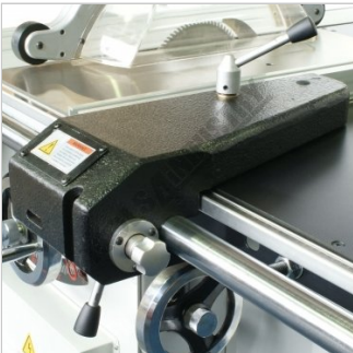
Heavy Duty Rip Fence