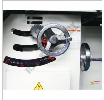
Height and Tilting Arbor Adjustment