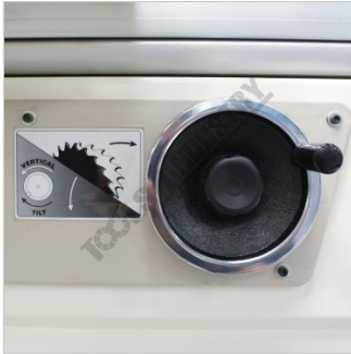
Tilting Arbor to 45 Degrees