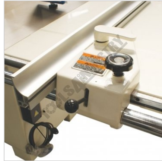
Heavy Duty Rip Fence