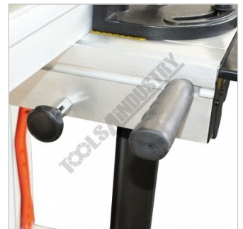
Sliding Table Lock