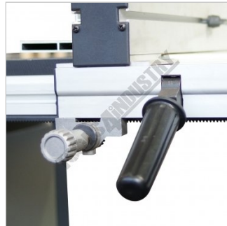
Micro Adjustment Rip Fence