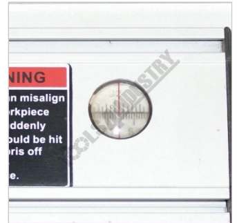
Rip Fence Sight Glass