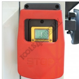
Safety Stop Switch