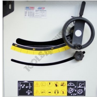
Tilt Arbor Gauge 45degrees And Blade Height Adjustment Hand Wheel