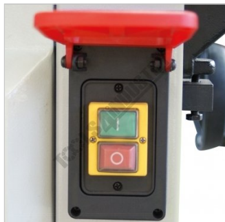
Safety Stop Switch Open