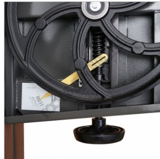
Blade Tension Hand Wheel And Guide