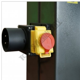
Electrical Emergency Stop