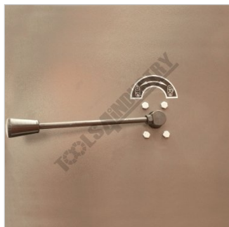
Quick Action Blade Tension System