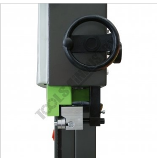
Blade Height Adjustment Wheel