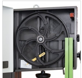
Heavy Duty Blade Wheels