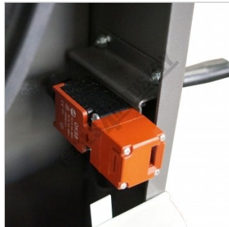
Safety Electrical Cut Out On Doors