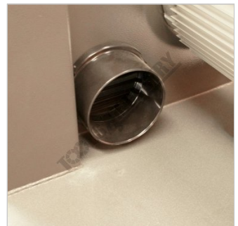
100mm Dust Port