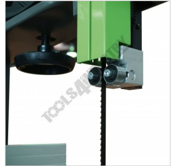
Top Roller Bearing Guide