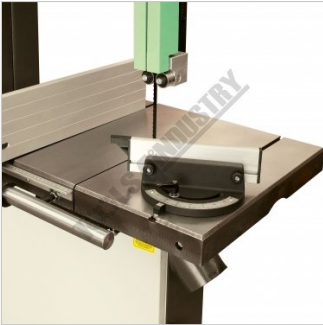
Cast Iron Table