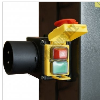
Main Power On Off Magnetic Switch