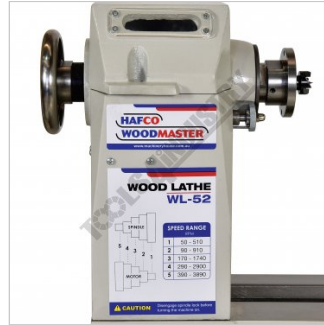
Visible Check Speed Selection