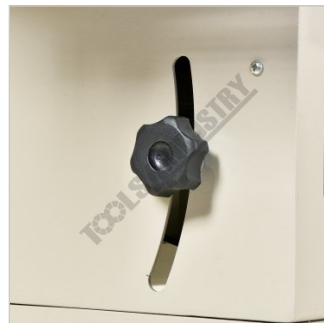
Motor Belt Tension Handle