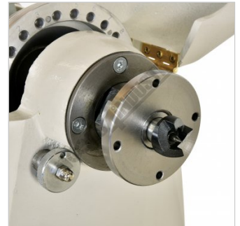
Main Spindle with Drive Spur