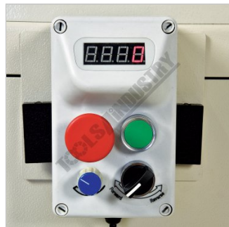
Variabe Spindle Speed Dial with Digital Readout Display