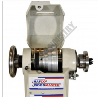
Flip Up Guard for Quick Belt Speed Change