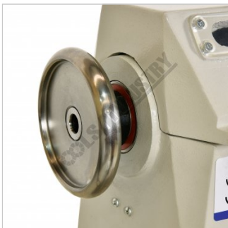
Spindle Hand Brake Wheel