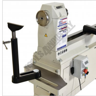
Bowl Turning Attachment