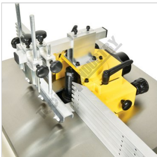
Cutter Guard with Dust Chute