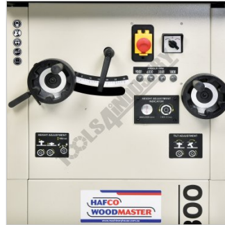
Spindle Adjustment Controls