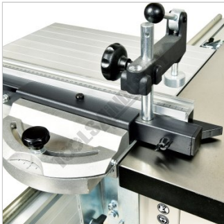
Includes Mitre Guide