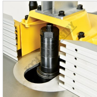
Tilting Arbor to 30 Degrees