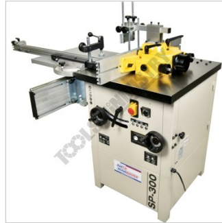
Sliding Table with Mitre Guide and Top Clamp