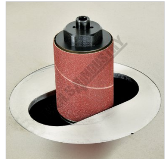
Sanding Sleeve Attachment