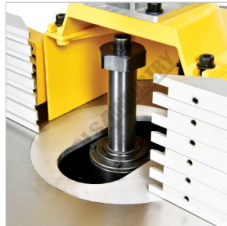
30mm Cutter Head