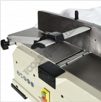
Adjustable Blade Guard