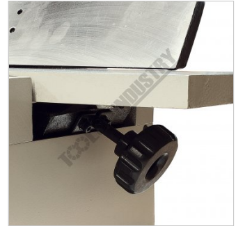
Table Height Adjustment Dial