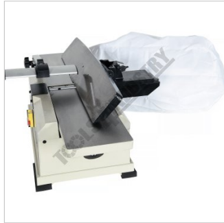
Adjustable Tilting Fence