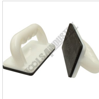
2 x Push Blocks