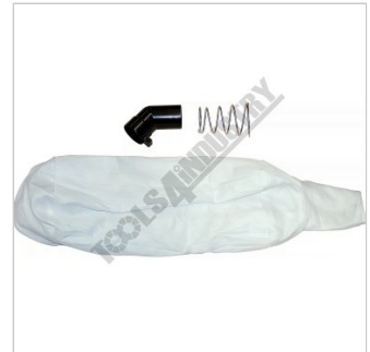
Included Dust Bag