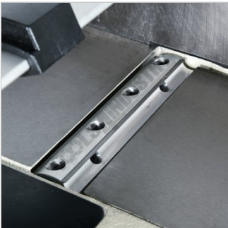
2 Blade Cutter Head