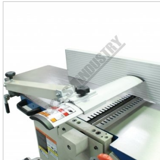
Adjustable Blade Guard