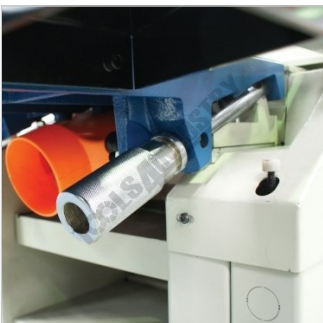
Table Height Adjustment