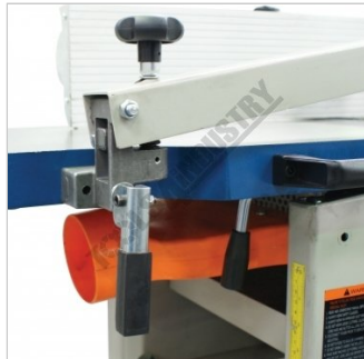
Blade Guard Tension