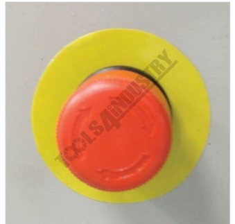
Safety Stop Switch