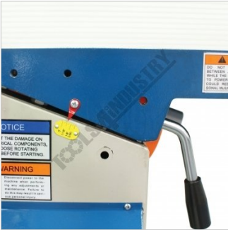
Table Height Gauge