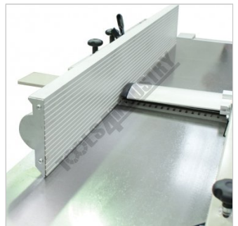
Aluminium Extrusion Fence