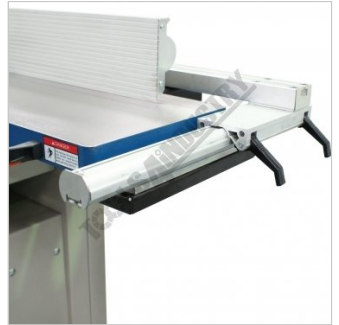
Adjustable Double Lock Fence