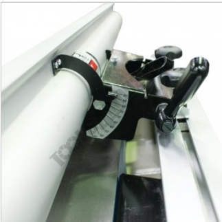
Adjustable Tilting Fence