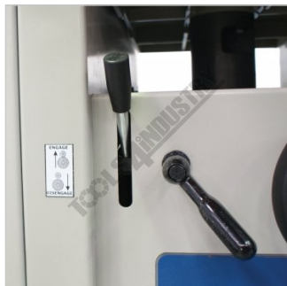
Feed Engage Levers