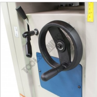
Table Height Adjustment Handle