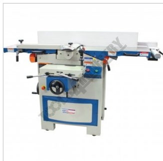
Shown with Optional PT300 Mortising Attachment (W615)