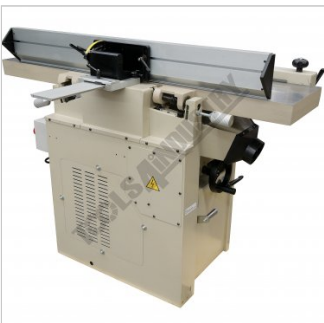
Rear Right View