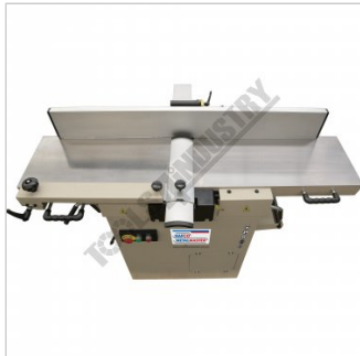
Front Top View