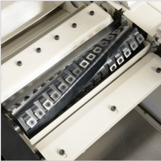
Spiral Cutter Head