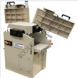
Set Up as a Thicknesser