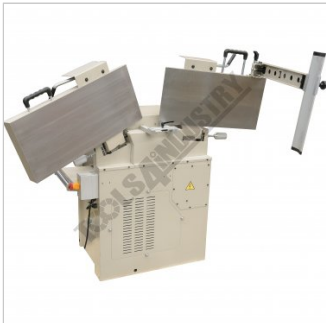
Thicknesser Setup - Rear View