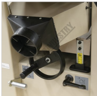
Dust Chute Set Up For Planer