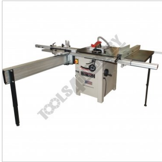
Shown With Optional Table Saw