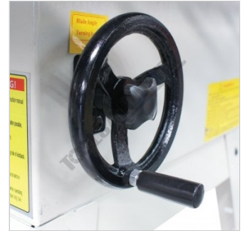
Tilting Arbor Hand Wheel and Lock