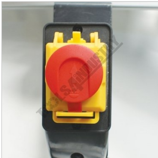
Magnetic Safety Switch