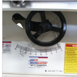
Tilting Arbor Gauge to 45 degrees and Blade Height Adjustment Hand Wheel and Lock