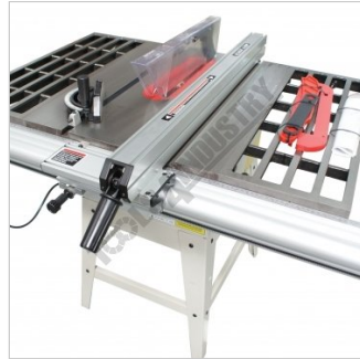
Heavy Duty Rip Fence with Micro Adjustment