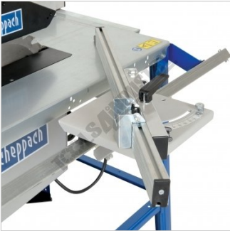
Sliding Table Rear View