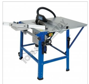
Extension Table Mounted On Side