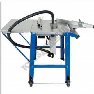
Extension Table Mounted On Side Rear