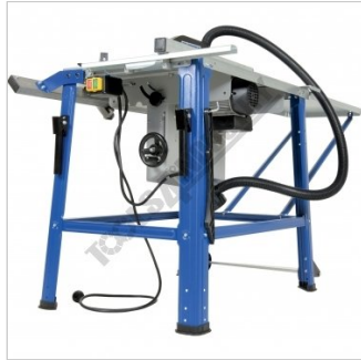
Low Right Front View