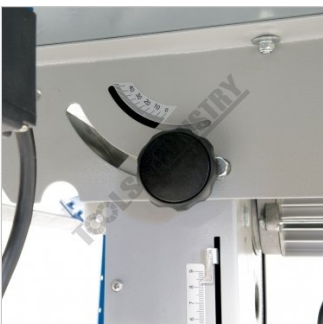
Blade Tilt Scale and Locking Handle