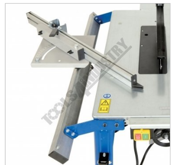
Sliding Table With Mitre Guide