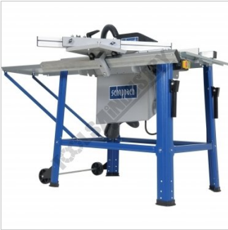
Low Front View