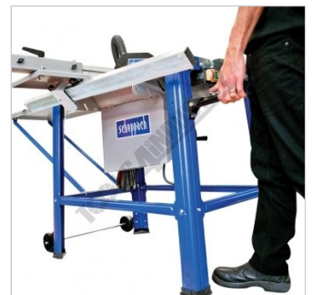
Mobile On Wheels