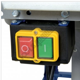
On Off Switch