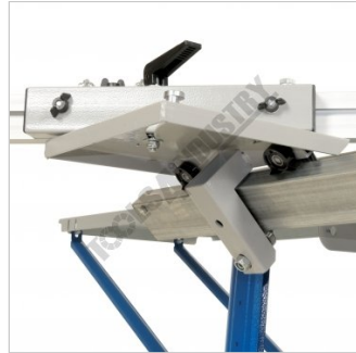
Sliding Table Design