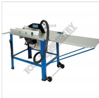
Right Rear View