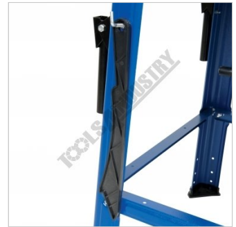
Storage Hooks For Push Stick