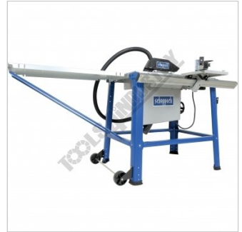
Low Left View