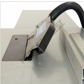
Blade At 45 Degrees Close Up