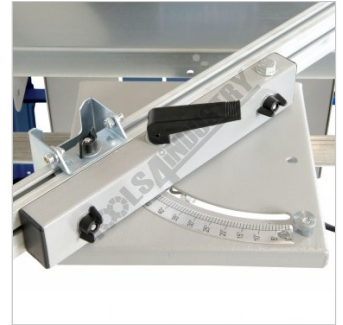
Mitre Guide Scale