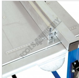
Cross Cut Scale