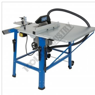
Extension Table Mounted On Side Right