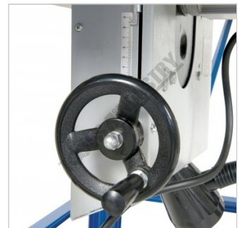
Blade Height Adjustment