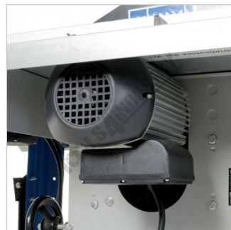
3hp 240V Induction Motor With Brake