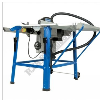
Extension Table Mounted On Side Low