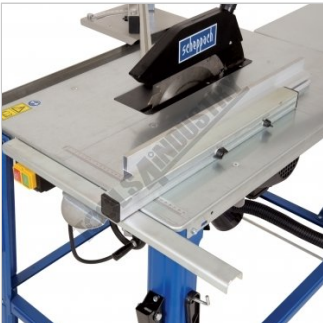
Cross Cut Fence