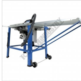
Low Rear View