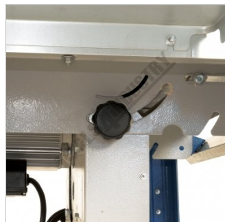
Blade Tilt Rear Locking Handle