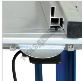
Cross Cut Fence Locking Lever