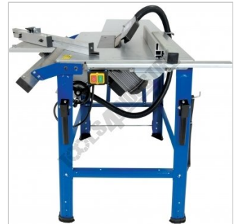
Blade Tilted to 45 Degrees