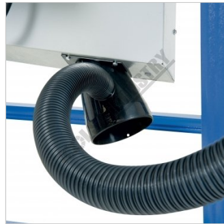
100mm Dust Outlet