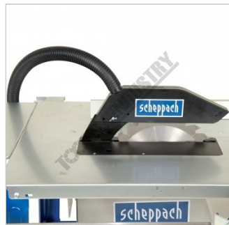
315mm Saw Blade With Blade Guard