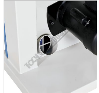
100mm Bottom Rear Dust Chute