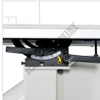
Table Tilt Adjustment