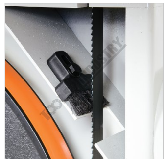
Blade Cleaning Brush