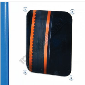
Blade View Window