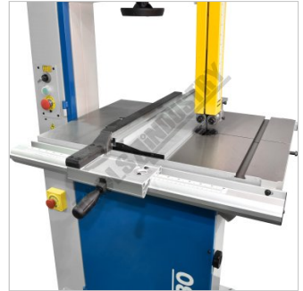
Sliding Rip Fence Down Position