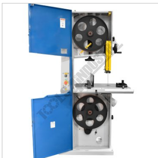
Shown With Blade Door Open