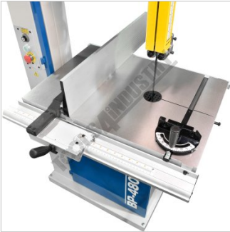
Large Cast Iron Table and Mitre Guide