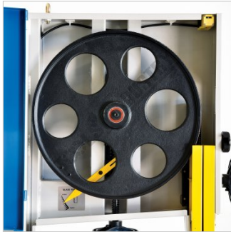
Cast Iron Blade Wheels