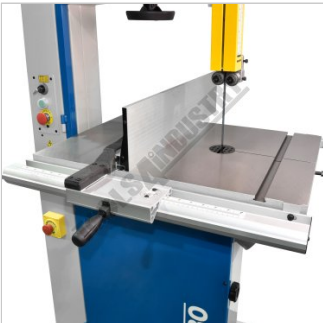
Sliding Rip Fence Up Position