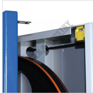
Safety Micro Switch On Door