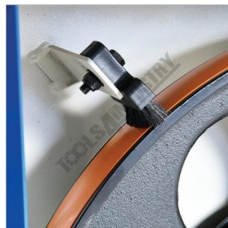
Wheel Cleaning Brush