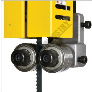
Ball Bearing Blade Guides