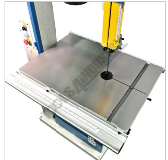
Large Cast Iron Table