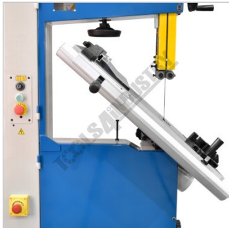
Cast Iron Table Tilts to 45 Degrees