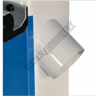
100mm Side Dust Chute