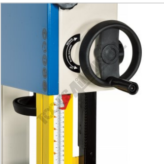
Rack Pinion Adjustment On Top Blade Guide