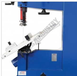
Cast Iron Table Tilts to 45 Degrees