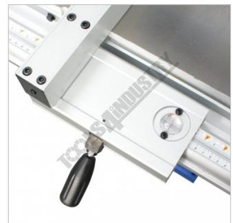
Rip Fence with Magnified Scale View