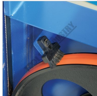
Blade Wheel Cleaning Brush