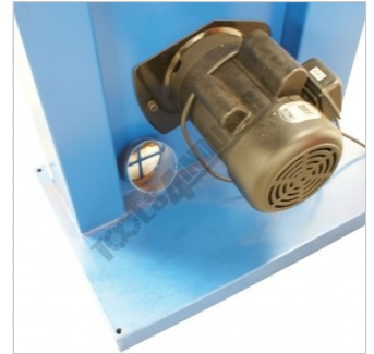
Bottom Rear Dust Chute