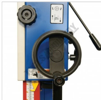
Blade Guide Height Adjustment Handle