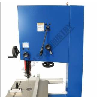
Quick Action Blade Tension Lever