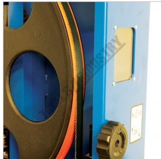
Orange Tyre for Ease of Blade Alignment Through Window