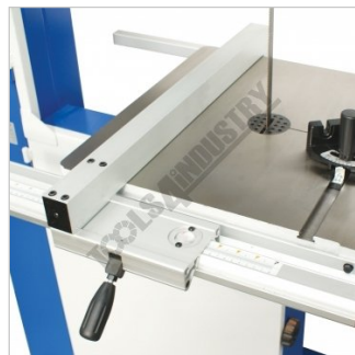
Sliding Rip Fence