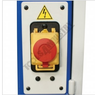
Magnetic Stop Switch