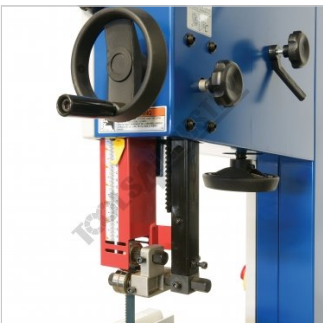
Rack & Pinion Adjustment on Top Blade Guide