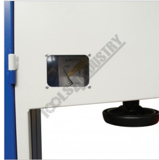
Blade Tension View Window