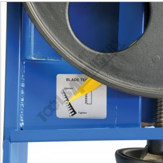
Blade Tension Sight Indicator