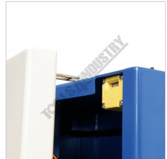
Safety Micro Switch on Doors