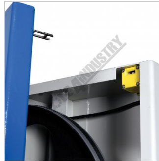
Safety Micro Switch On Door