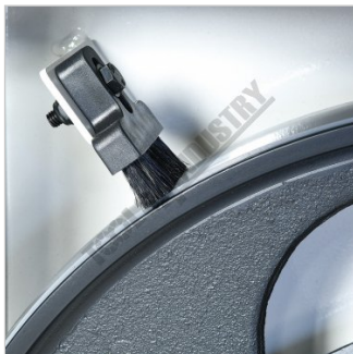
Wheel Cleaning Brush