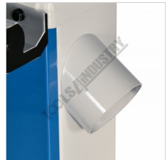
100mm Side Dust Chute