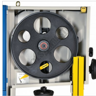
Heavy Duty Cast Iron Wheels