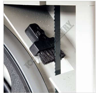
Blade Cleaning Brush