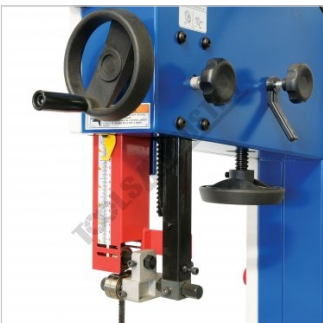
Rack & Pinion Adjustment on Top Blade Guide