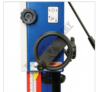
Blade Guide Height Adjustment Handle