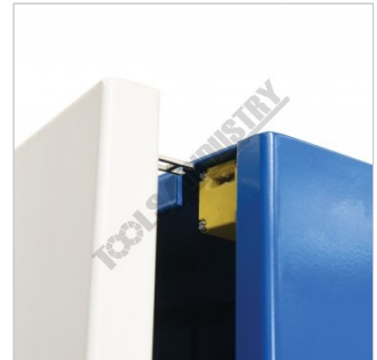
Safety Micro Switch on Doors