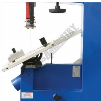
Cast Iron Table Tilts to 45 Degrees