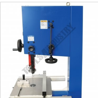
Quick Action Blade Tension Lever