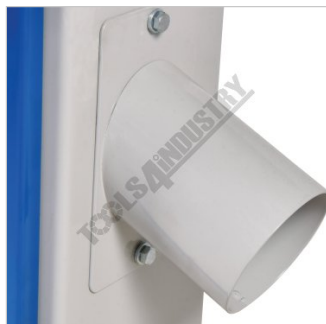
100mm Side Dust Chute