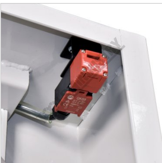
Safety Micro Switch on Doors