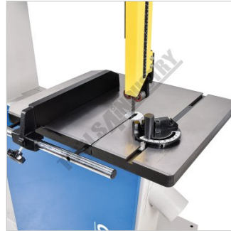
Cast Iron Table