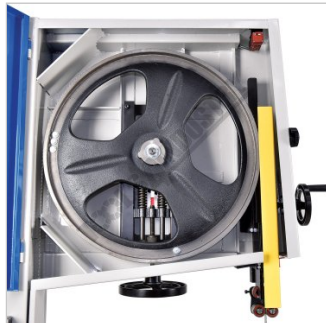
Heavy Duty Cast Iron Wheels