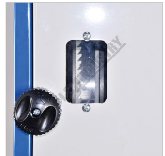
Blade View Window