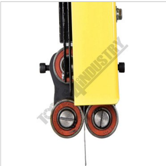
Ball Bearing Blade Guides