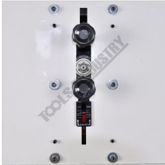
Blade Width Tension