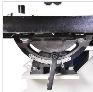
Table Tilt Adjustment