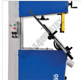
Cast Iron Table Tilts to 45 Degrees