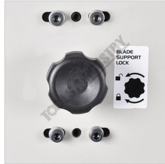
Blade Support Lock