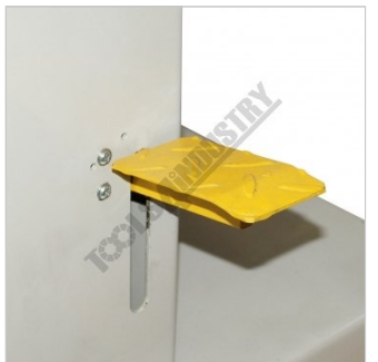
Foot Brake Lever