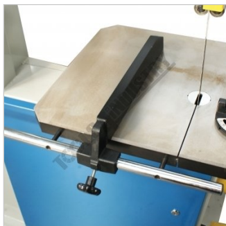
Sliding Rip Fence