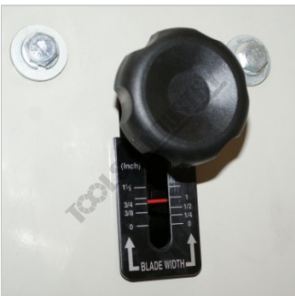
Blade Width Tension Indicator