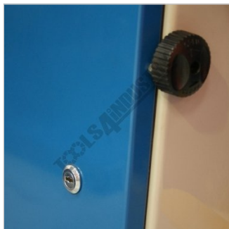
Key Lockable Blade Covers