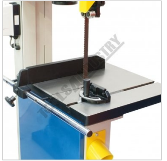
Table with Sliding Rip Fence