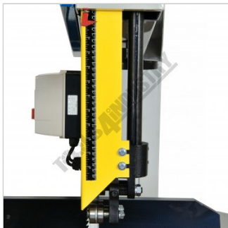
Blade Height Indictaor