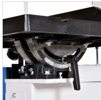
Table Tilt Adjustment