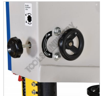
Blade Height Adjustment-Lock