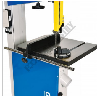
Table With Sliding Fence