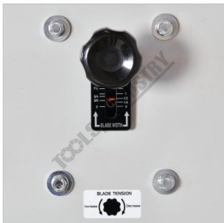
Blade Width And Tension