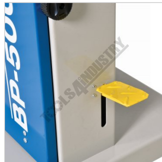
Foot Brake Lever