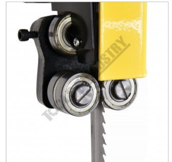
Ball Bearing Blade Guide