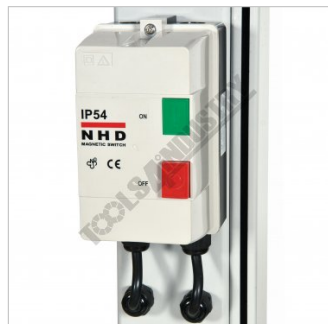
Magnetic Safety Switch