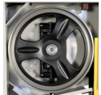
Heavy Duty Cast Iron Wheel