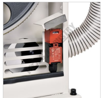
Safety Micro Switch on Doors