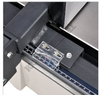
Sliding Rip Fence Scale