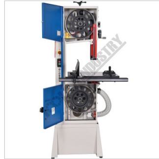
Shown With Blade Guards Open