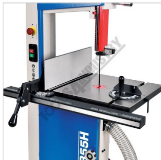
Sliding Rip Fence Up Position