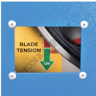
Blade Tension Window