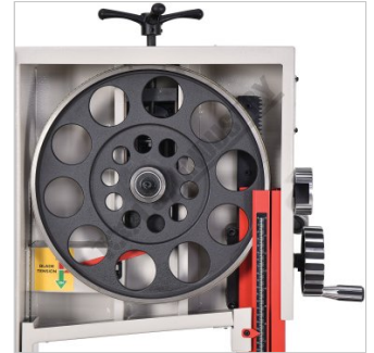
Heavy Duty Cast Iron Wheels