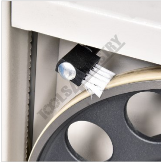
Blade Cleaning Brush