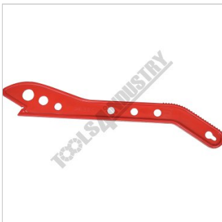
Material Push Stick