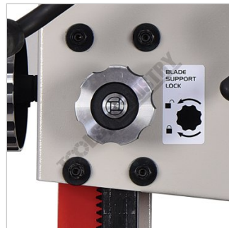
Quick Action Blade Tension Lever