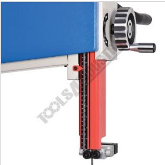
Blade Guide Scale