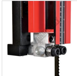
Ball Bearing Blade Guides