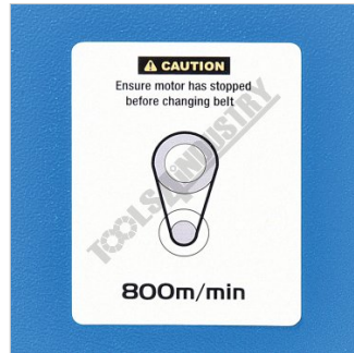
Blade Speed 800 metres per minute