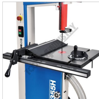
Sliding Rip Fence Down Position