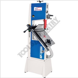
Shown with Table at 45 Degrees