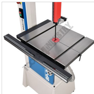
Large Cast Iron Table