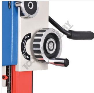
Blade Guide Hand Wheel