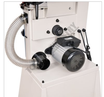
100mm Side Dust Chute