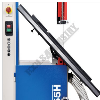
Table Tilts to 45 Degrees