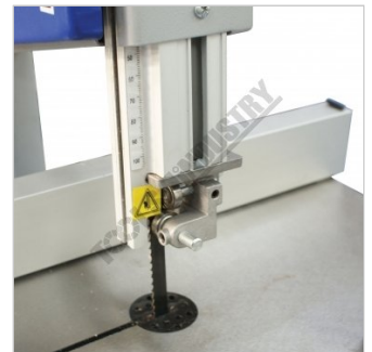
Geared rack height adjustment