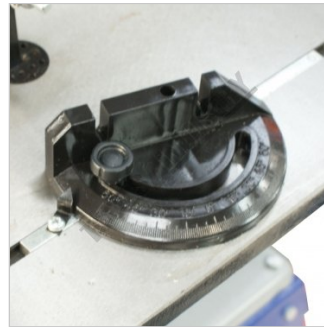
Mitre Guide 0 45 Degrees