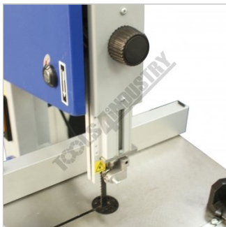
Blade Guide Adjustment