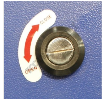
Safety Locks on Doors