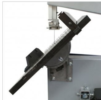
Cast Iron Table Tilts 0 45 degrees