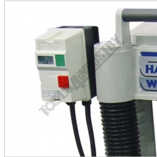
Magnetic Safety Switch