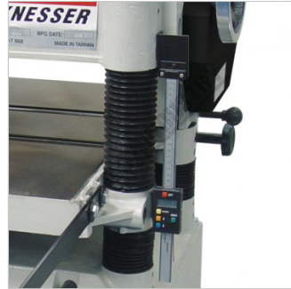
Digital Height Readout