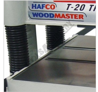
Robust 4 Post Design