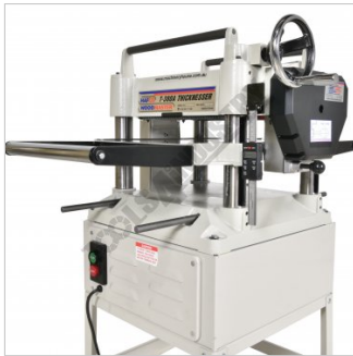
Robust 4 Post Design