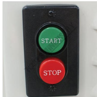
On Off Switch