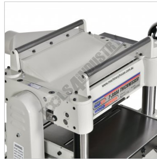
Feed Return Rollers