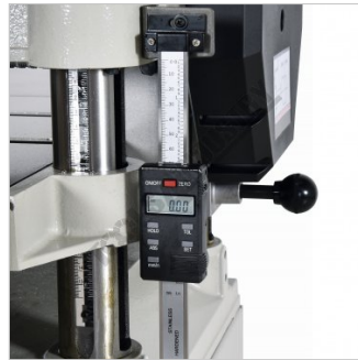
Digital Height Readout