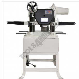
W414 Side View