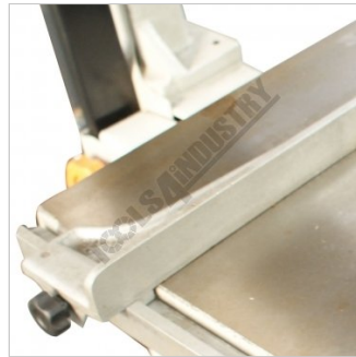
Sliding Rip Fence