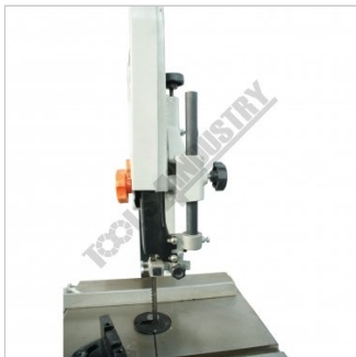
Blade Height Adjustment