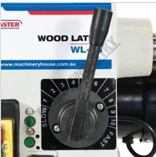
Variable Speed Lever