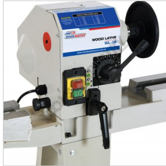
Headstock Left View