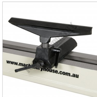
Standard Tool Rest