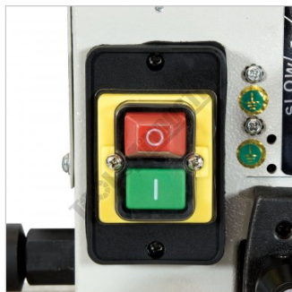
Switch On Off