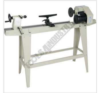
Rear Left View