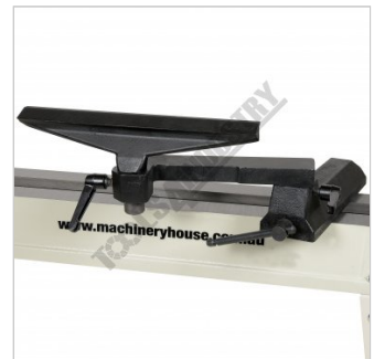
Outrigger Tool Rest