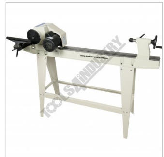
Bowl Turning Setup Right View