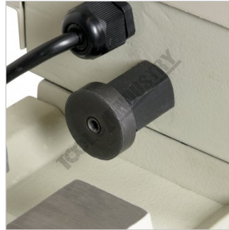
Swivel Head Release Lock