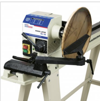
Shown Set Up with Bowl