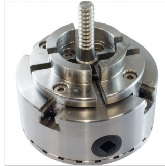
Shown With Wood Screw