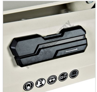
Blade Storage Holder