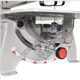
Dust Extraction Chute Tilt Handle