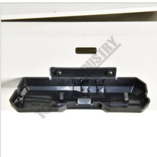
Blade Storage Holder Open