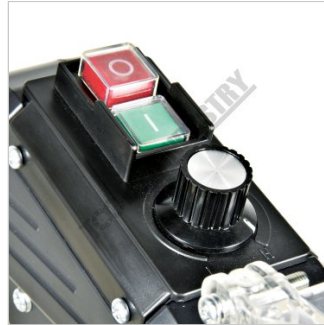
Variable Speed Dial and On Off Switch