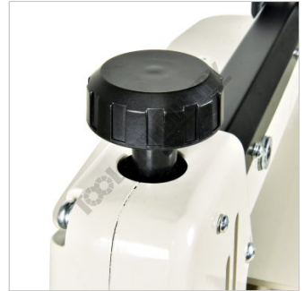
Blade Tension Handle