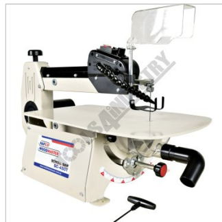
Shown with Safety Guard Raised