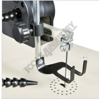
Blade Guide Adjustment