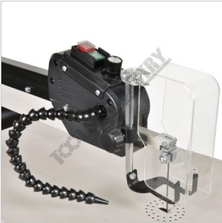
Dust Blower and Safety Guard