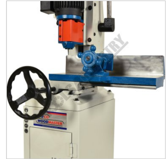
Table movement left and right