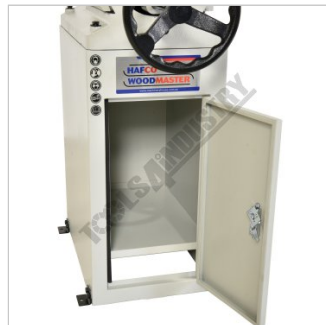
Large storage cabinet