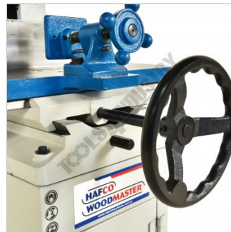
Cross slide and table travel handwheel