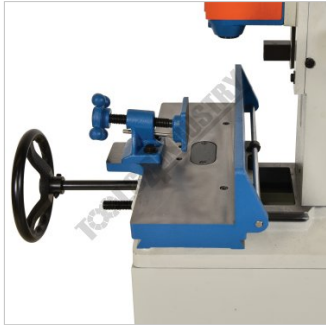
Table Travel-heavy duty device