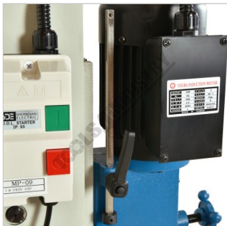
Adjustable depth stop