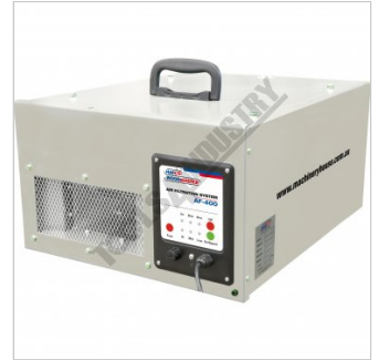
Shown with Lifting Handle