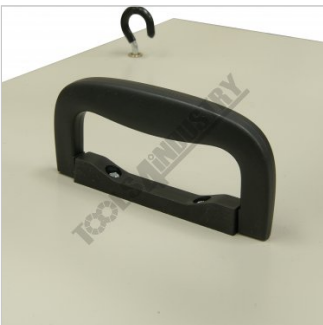
Lifting Carry Handle