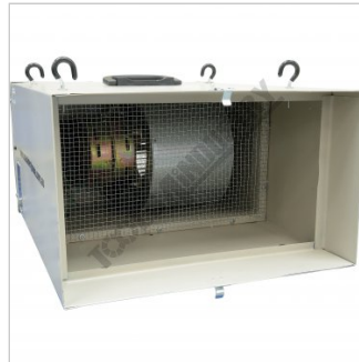
Shown with Filters Removed