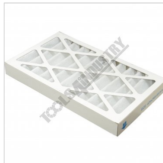
First Stage External Filter