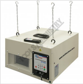
Includes Ceiling Hooks and Chains