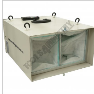
Rear View with 1st Stage Filter Removed