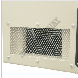
Clean Air Outlet