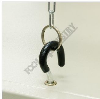
Swivel Mounting Hooks