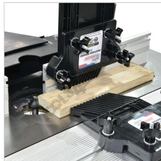
In Use Router Table