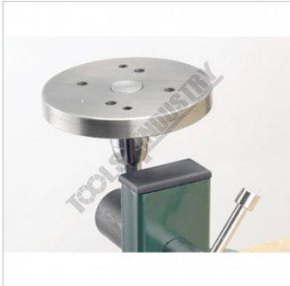
360 Degree Rotation