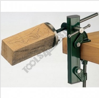
Access from any Angle