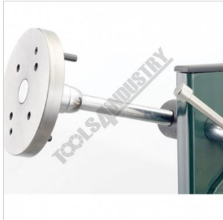
Pivoting Support Arm