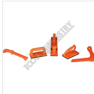
5 Piece Set