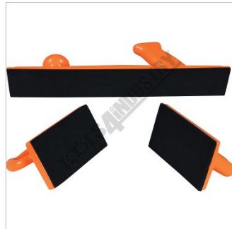
Foam Base On Push Blocks