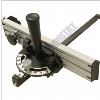
Fence Fully Closed