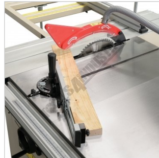
Shown on a Table Saw Side View