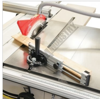
Shown on a Table Saw