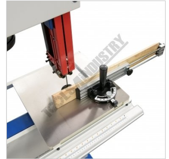
Shown on Wood Bandsaw