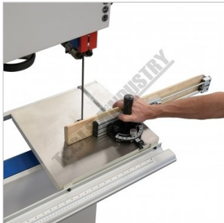
Shown on a Wood Bandsaw Action