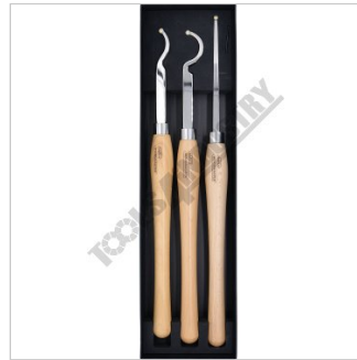
Top View In Case