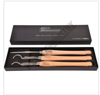
Box Packaging Open