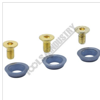
Replaceable Carbide Tips