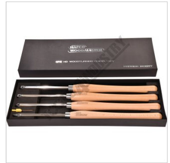
Box Packaging Open