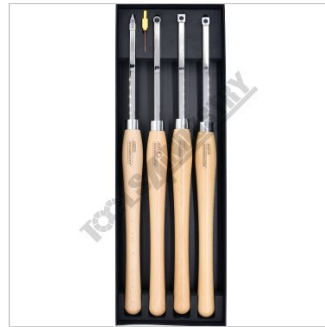
Top View In Case