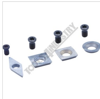
Replaceable Carbide Tips