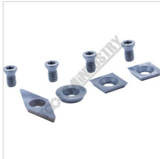
Replaceable Carbide Tips