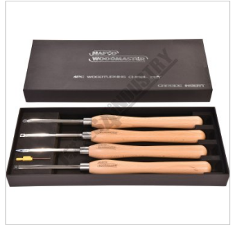
Box Packaging Open