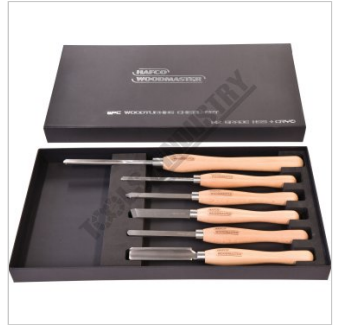
Box Packaging Open