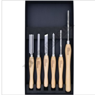
Top View In Case