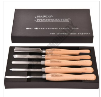
Box Packaging Open